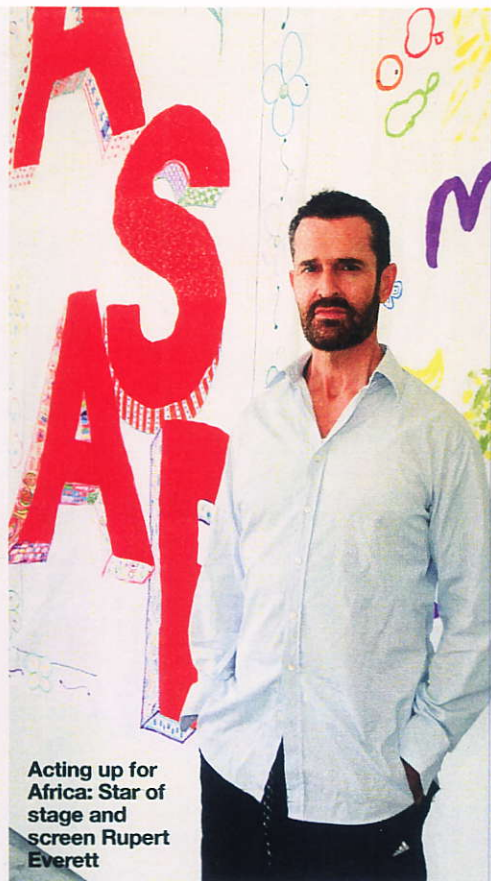
Acting up for Africa: Star of stage and screen Rupert Everett